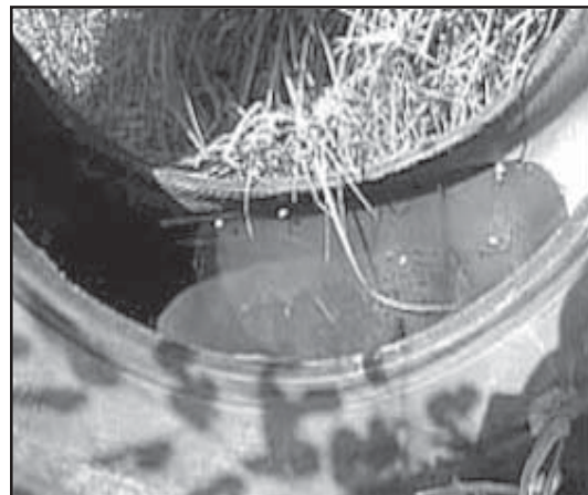
Poorly managed scrap tires can create a breeding ground for disease-carrying mosquitoes.