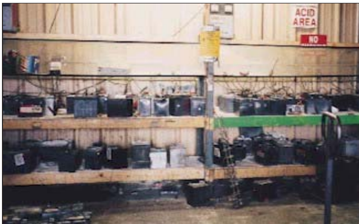
This company has an indoor battery storage area which is well ventilated. An impervious floor helps contain spills and leaks.

If you do not recycle lead acid batteries, you must evaluate them before they are disposed to determine if they are hazardous. Because of the lead and acid contained in these batteries, they will likely be a characteristic hazardous waste. These must be sent to a permitted hazardous waste disposal facility if they are not recycled. You should also be aware that if you are reclaiming batteries yourself on-site by opening batteries and removing acid and/or lead, you are subject to additional hazardous waste regulations. There may also be surface water and air pollution regulations that apply to these activities.