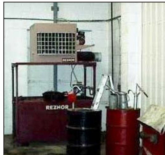
Burning used oil in a space heater can help offset the cost of heating your shop.

It's important to know that burning used oil in space heaters causes air pollution.