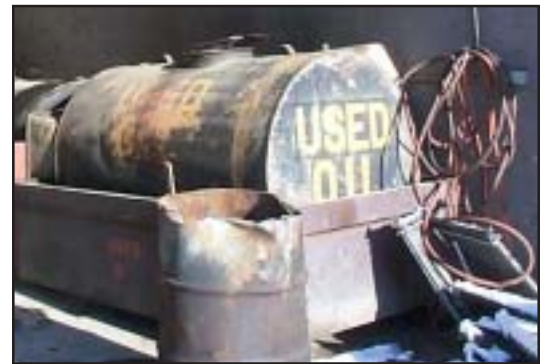
Secondary containment around oil tanks and containers helps to prevent leaks and spills and can help you avoid a costly cleanup.

Contact your local Ohio EPA district office, Division of Emergency and Remedial Response for more information on the SPCC requirements.