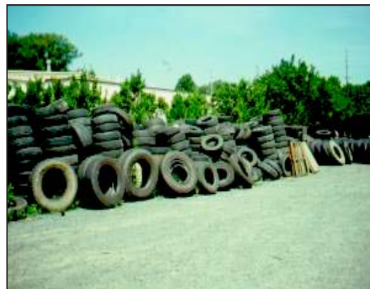
Outdoor tire piles create a health and fire hazard.

Tires that are removed from vehicles (both those on and off rims) are defined as scrap tires.