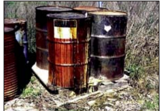
Drums of hazardous waste need to be stored to prevent leaks and spills. Leaking drums, especially in outdoor areas could lead to a costly cleanup!

If you have a material that can no longer be used, it is considered a waste. There are two ways in which your waste can be classified as a hazardous waste.