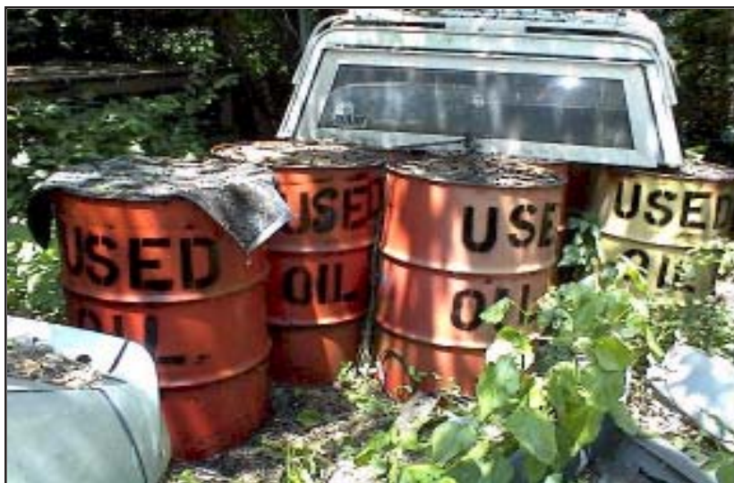
Although these drums are labeled, they are stored in a poor location outside. Don't do this at your shop.

As a generator, you must ensure that used oil is properly managed by a recycling or disposal company. The best way to manage used oil is to send it off site to a recycling company. The regulations encourage different recycling options such as reconditioning, refining, reusing or burning for energy recovery.